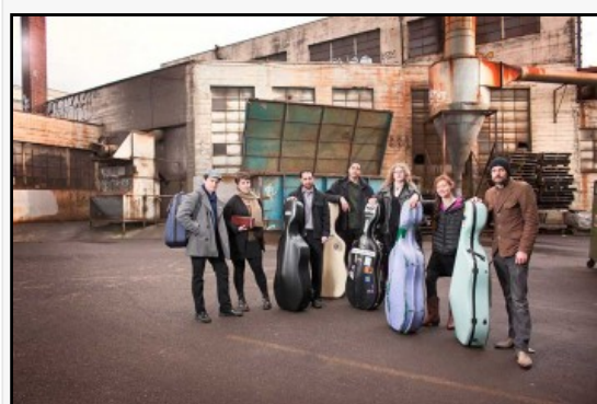
The Portland Cello Project

When the Portland Cello Project comes to the area for a concert, you can never be sure how many musicians there will be onstage or which ones they will be. But, you can be sure that it will be a good show.